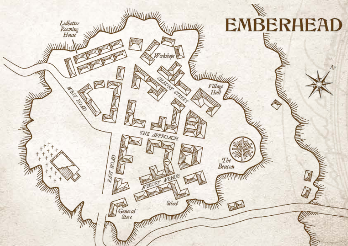
Map of Emberhead

To investigate behind the bookcase, go to 153. To close it and make your escape while you can, go to 120.