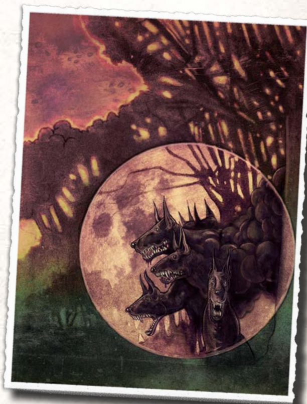
Pack of beasts